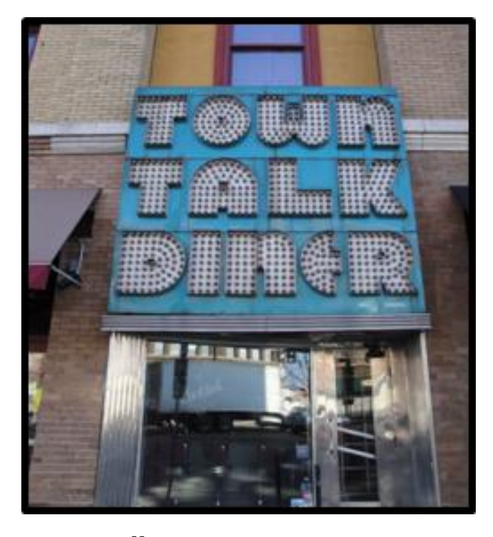
Town Talk Diner 2707 ½ East Lake Street Construction: 1946 • Local Designation: February 8, 2013

Minneapolis Heritage Preservation Commission