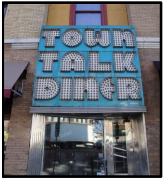
Town Talk Diner